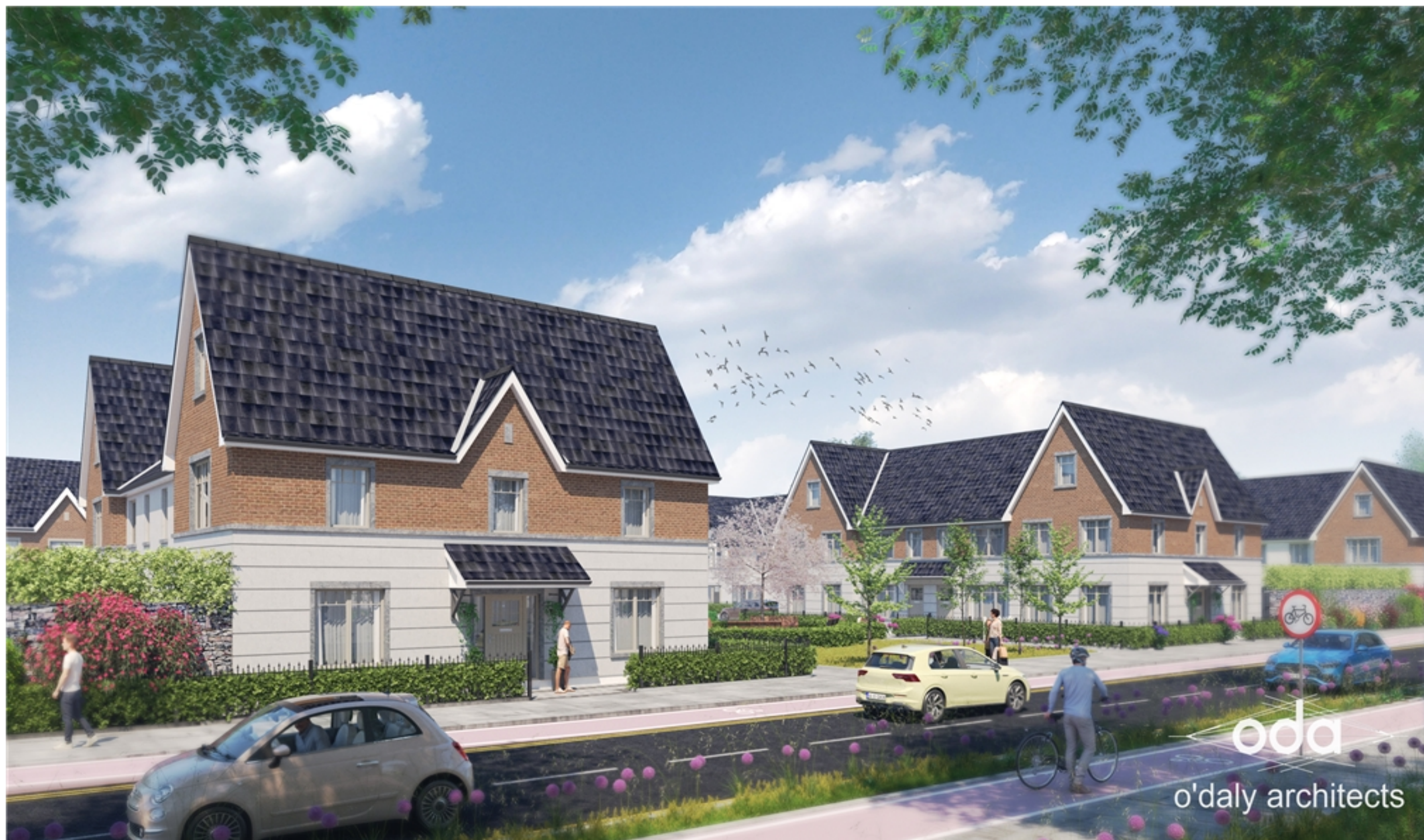
VIEW 2 Proposed Housing view from East