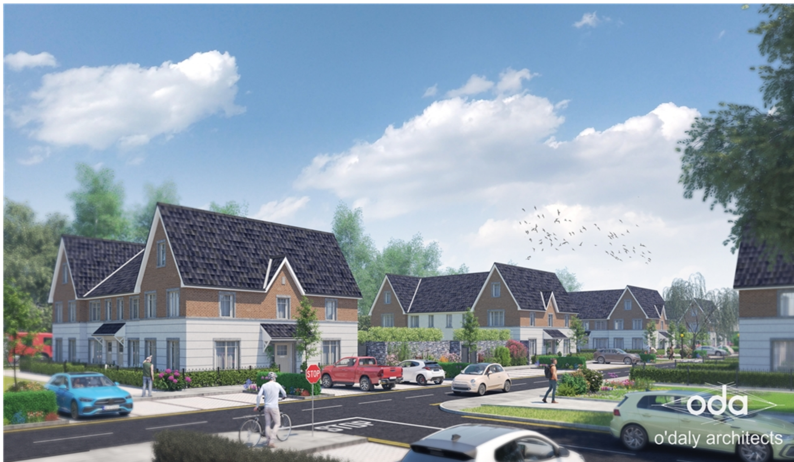
VIEW 4 Proposed Housing viewed from North West