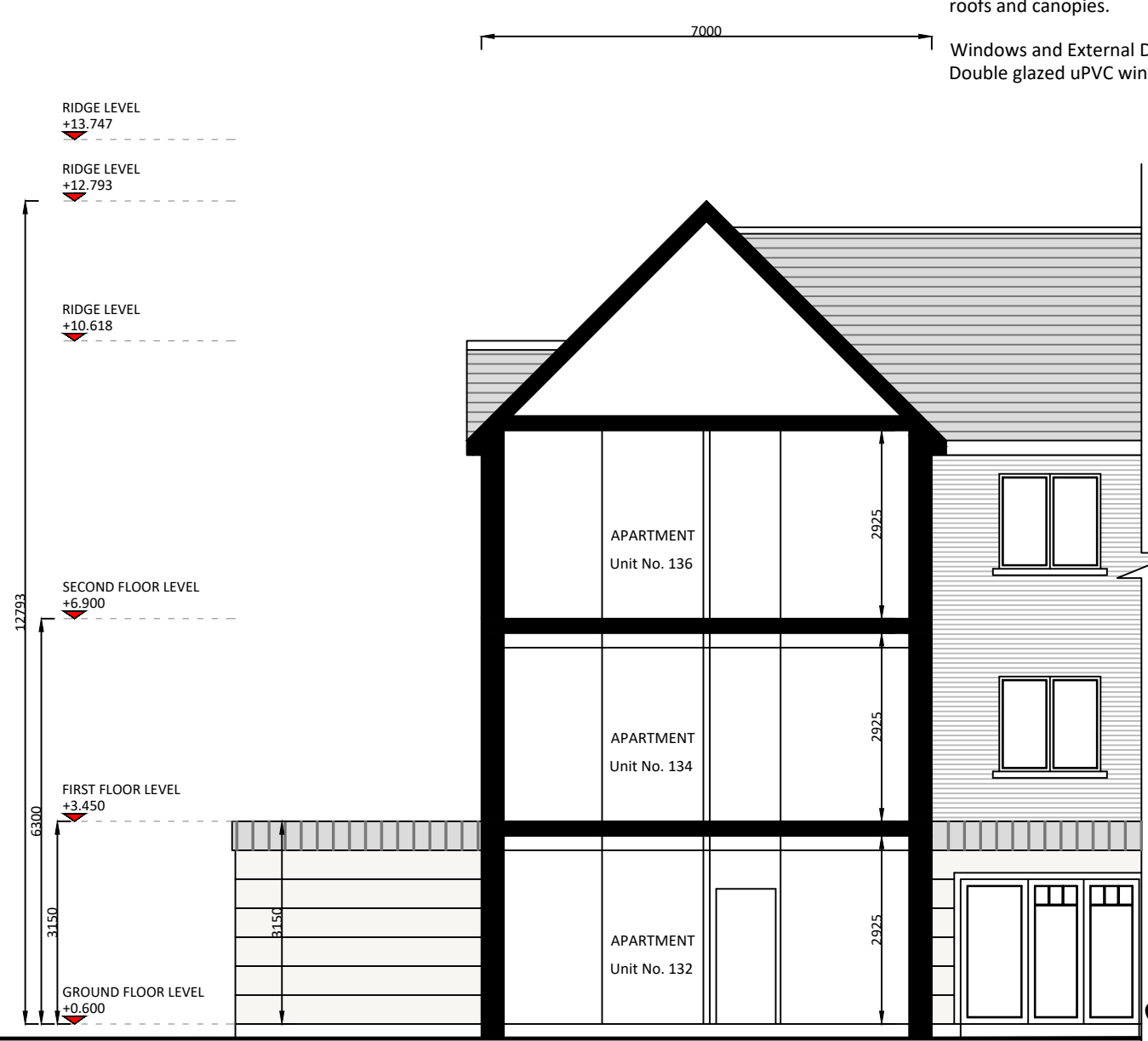
SECTION A - A Scale 1:100