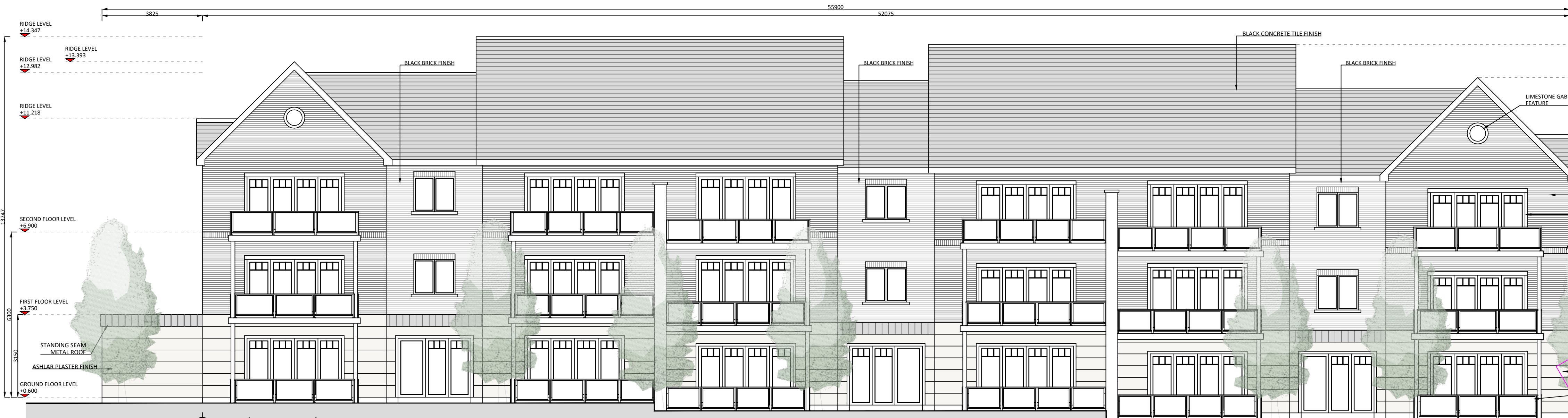
REAR (SOUTH WEST) ELEVATION Scale 1:100