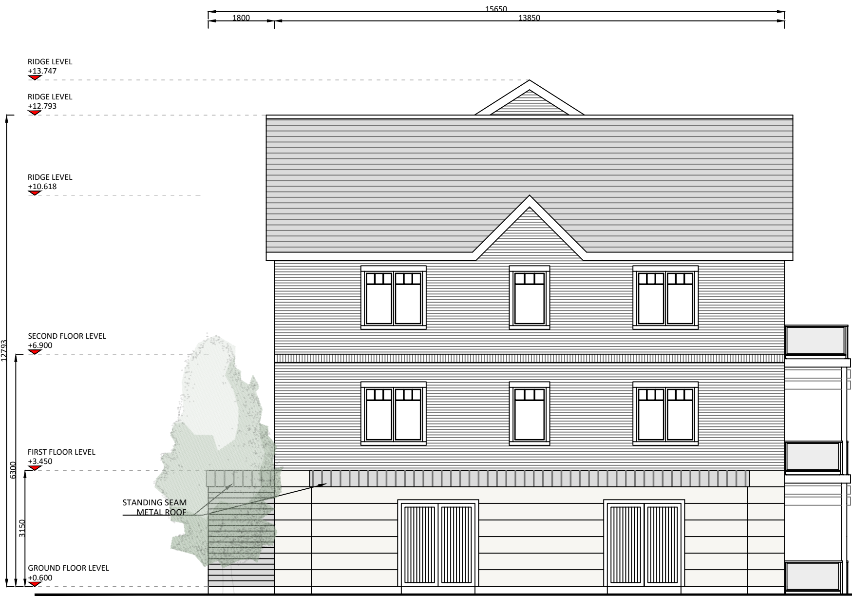
SIDE (NORTH WEST) ELEVATION Scale 1:100

Windows and External Doors: Double glazed uPVC windows in pebble / cement grey colour. Composite front door unit in selected colour.