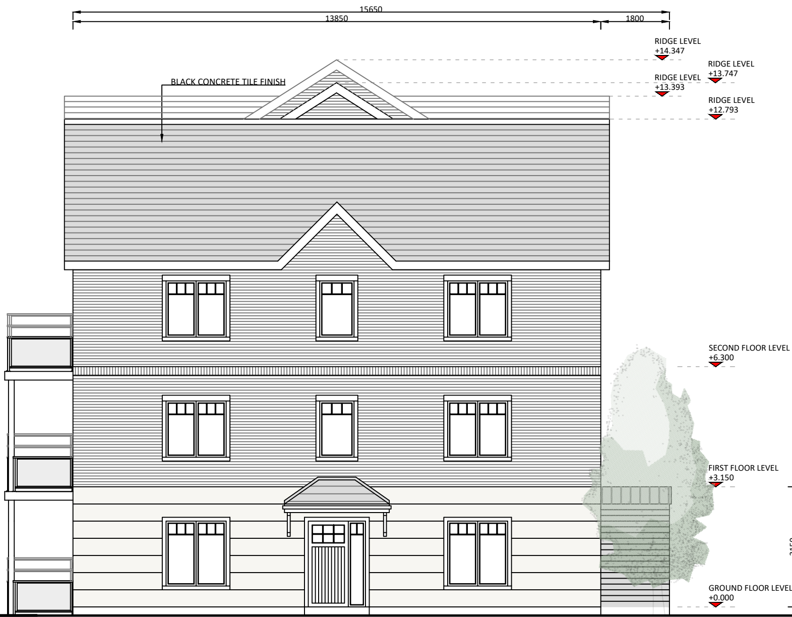
SIDE (SOUTH EAST) ELEVATION Scale 1:100